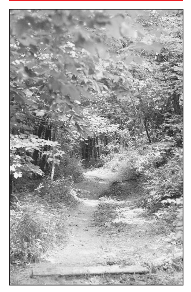
MORAINE VIEW STATE RECREATION AREA